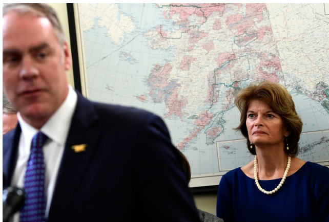
Sen. Lisa Murkowski listens as Interior Secretary Ryan Zinke speaks about his department's decision to construct a road through Izembek National Wildlife Refuge in Alaska.

"We've certainly had other large fights before," she adds, "but nothing this comprehensive."